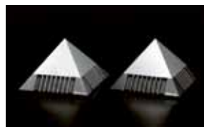
Nagra PMA (mono) and PSA (stereo) MOSFET transistor amplifiers