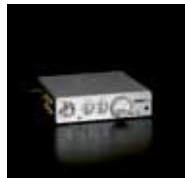
Nagra PL-L tube line preamplifier