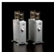
Nagra VPA monoblock tube amplifiers