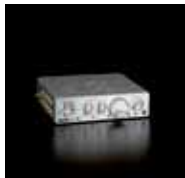
Nagra PL-P tube phono/line preamplifier