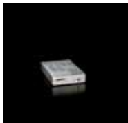
Nagra BPS transistor phono preamplifier