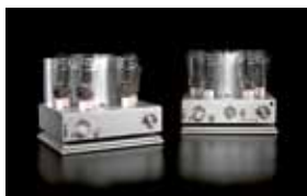
Nagra 300p (power) and 300i (integrated) triode tube amplifiers