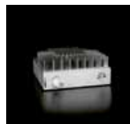
Nagra MSA MOSFET transistor stereo amplifier