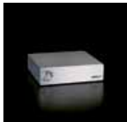
Nagra VPS tube phono preamplifier