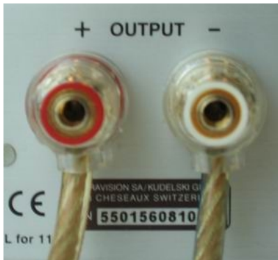
Connecting bare wire cable ends or spade lugs