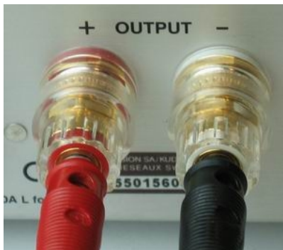
Connecting cables equipped with banana plugs

The Pyramid features isolated connectors to comply with security regulations.