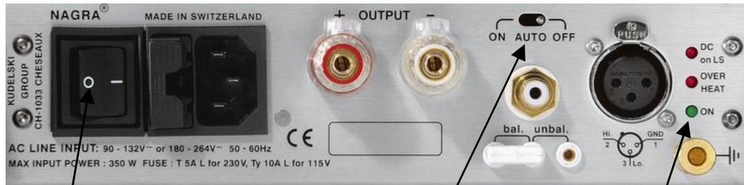
(a) Mains switch

Proceed only once you have completed the installation steps described in the previous chapter Installation .