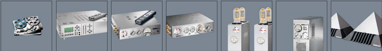
Nagra Hi-Fi range of products includes a miniature recorder, a digital to analog converter, preamplifiers, vacuum and solid-state power amplifiers.

Nagra is a division of the Kudelski Group 1033 Cheseaux - Switzerland www.nagraaudio.com