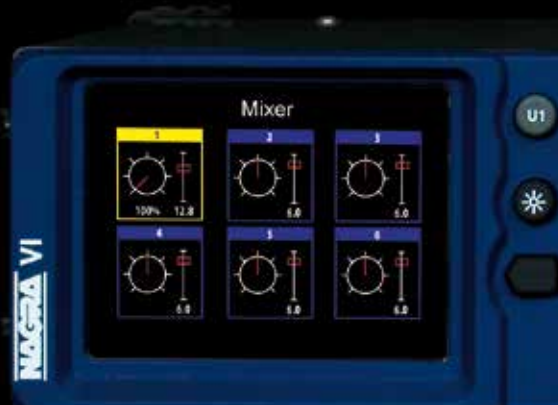
Mixer with pan