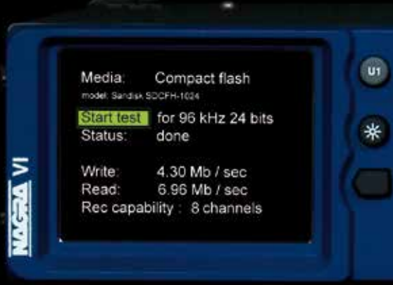
Media speed test