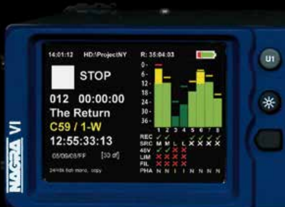
Main display screen: shows status, levels and menus of the recorder