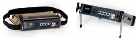
Supplied with the Nagra VI: robust weather resistant carrying case, battery pack, power supply, carrying handles and easily attached supporting legs